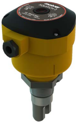
Threaded Squitch 2