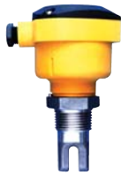
Squitch 2 Level Switch