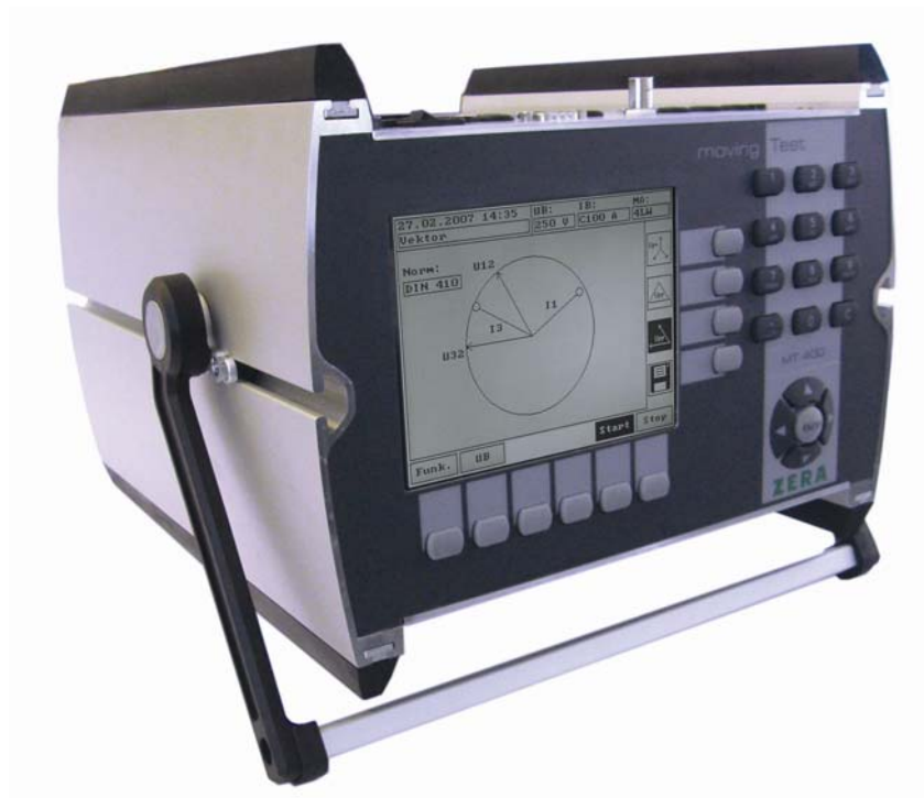
Three Phase Current Source